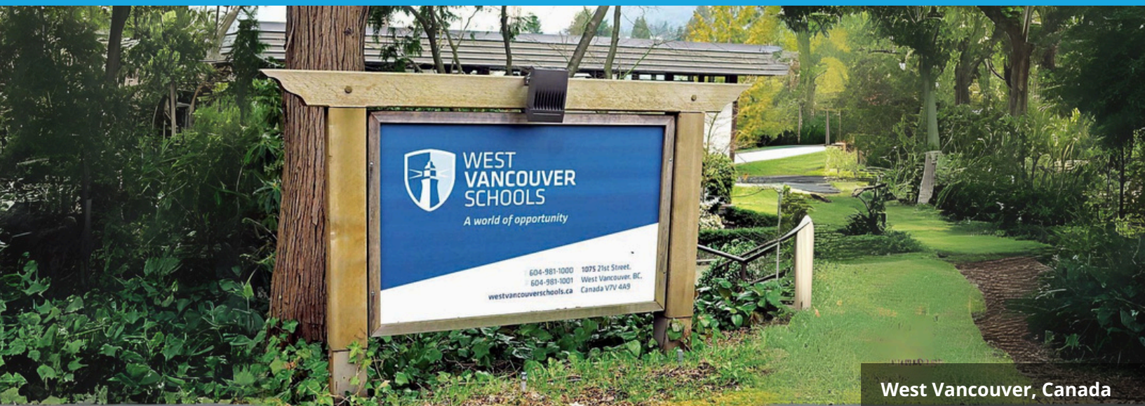
West Vancouver, Canada